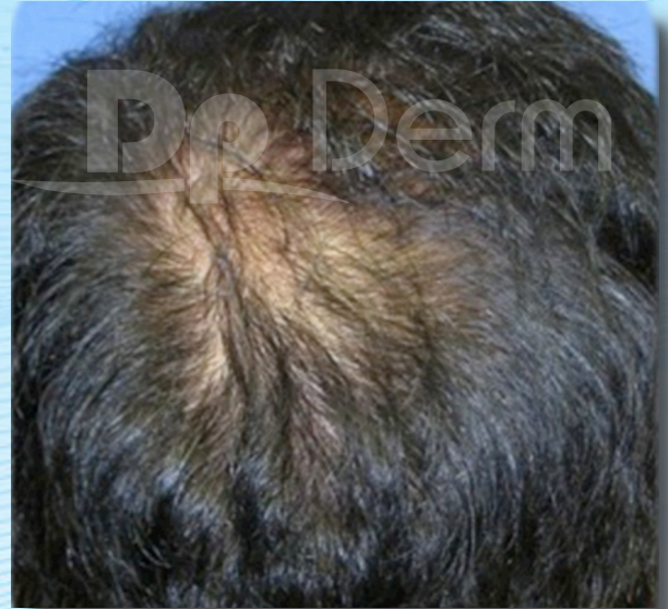
After 8 Month Treatment Course