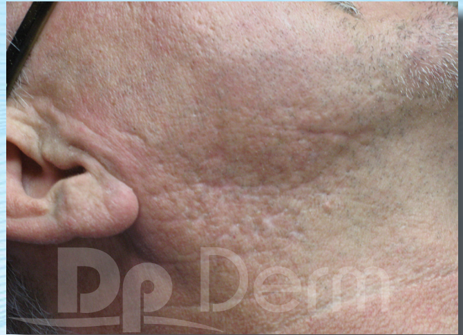
After 3 Cross Treatments