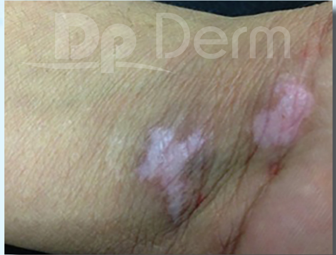
After 2 Treatments