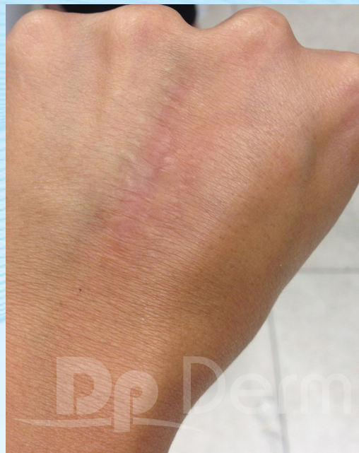
After 4 Treatments