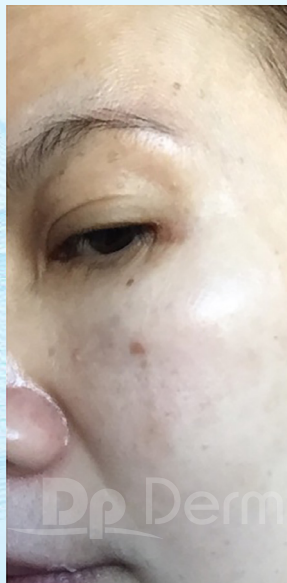
After 6 Treatments