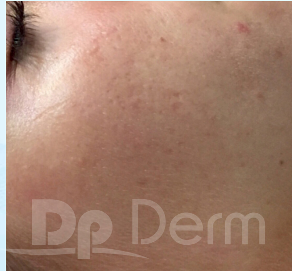
After 2 Treatments