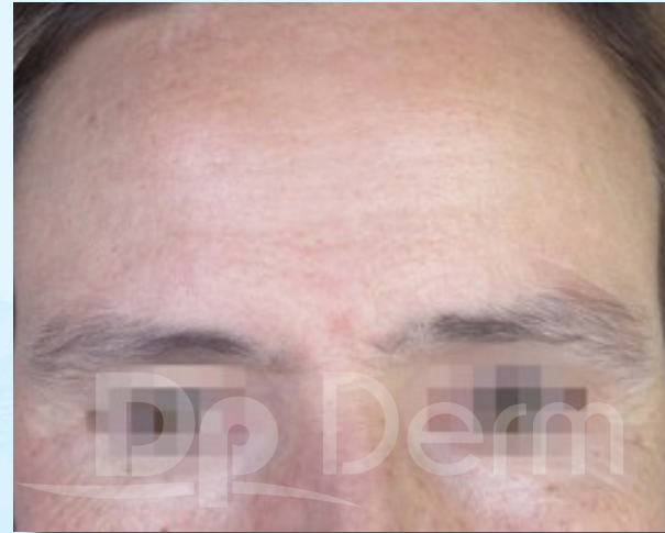
After 2 Treatments