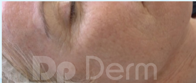
After 4 Treatments