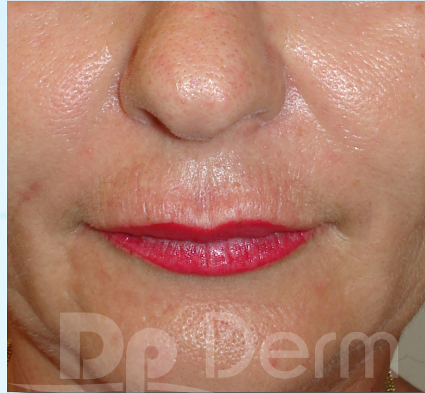
After 2 Treatments