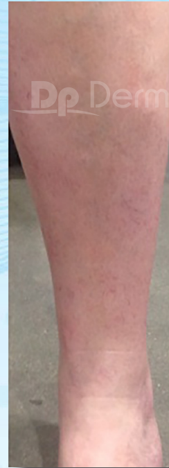
After 9 Treatments