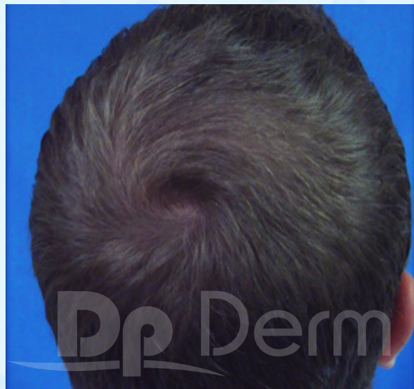
After 8 Month Treatment Course