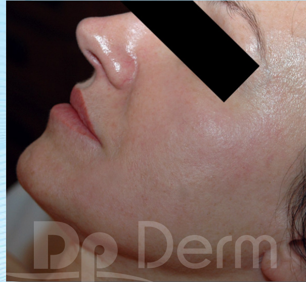
After 4 Treatments

*Courtesy of Dr Marzena Lorkowska-Precht (Poland)